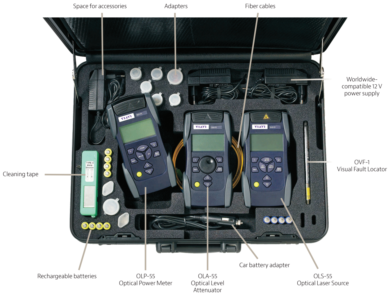
Figure 1. The hard case provides room for three instruments

The SmartClass OMK-55 may also include an optional SmartClass OLA-55 Optical Level Attenuator. Due to low differential group delay (DGD), the OLA-55 is suitable for up to 40 Gbps systems.